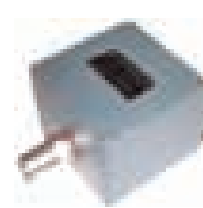
P/N B13-021 High temperature housing