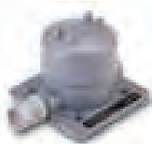
P/N 10252-1, CSA approved, explosion-proof housing P/N 10252-3, CSA approved, high temperature housing