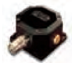
P/N B13-020 polyester housing